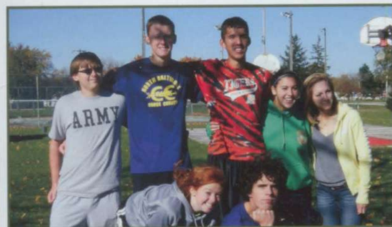
The seniors huddle for one more picture at the last practice.