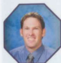
Luke Archer Art