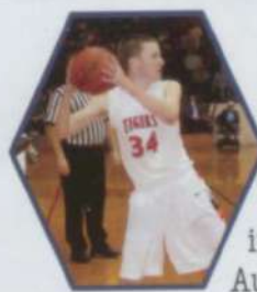
"My shooting away from the basket is what I need to improve on," said Austin.