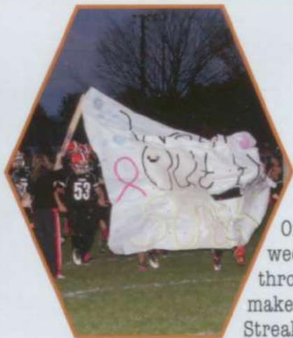
One of the weekly run through the squad makes. "Wipe out the Streaks!"